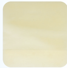
Actolind® Hydrocolloid Hydrocolloid adhesive, absorbent, waterproof wound dressing

We offer optimal solutions for wound healing thanks to modern wound care dressings designed with the clinical experience we have accumulated in wound care.