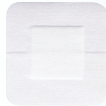
Actolind® Wound Pad Adhesive / Transparent Highly retentive wound dressing